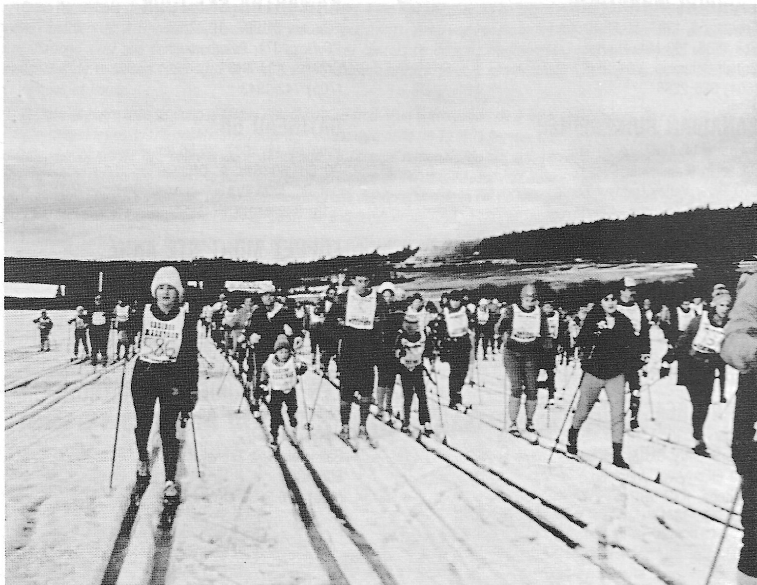
Cariboo Marathon, British Columbia

Comme vous pouvez le constater, l'Odyssée de ski s'adresse à tous. Les distances varient entre dix et soixante-cinq km et les gens de tout âge et de tout calibre sont invités. À vous de tenter l'aventure.